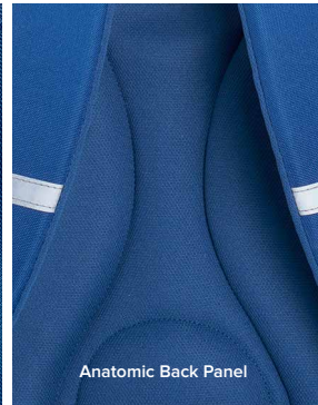
Anatomic Back Panel